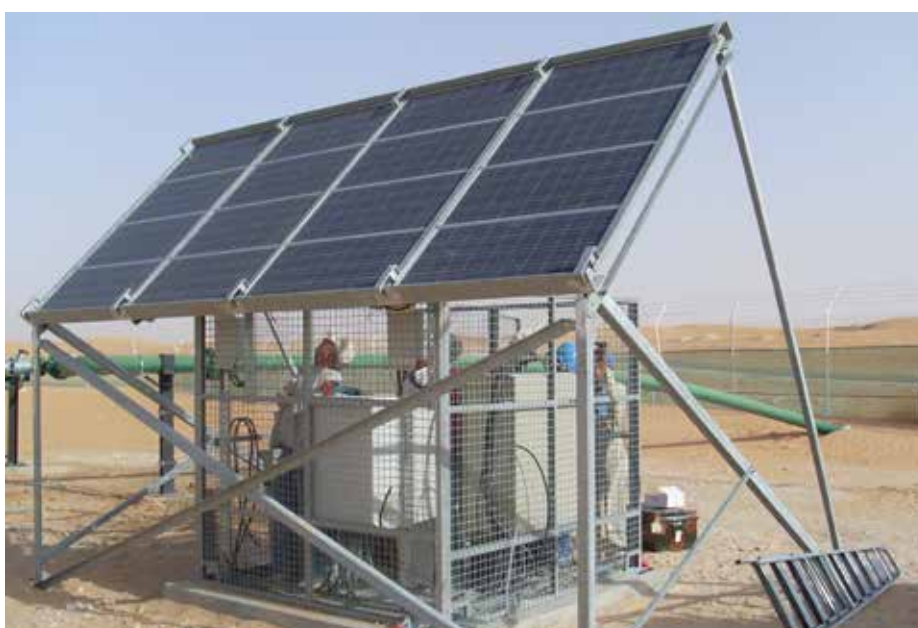
Oil & Gas project